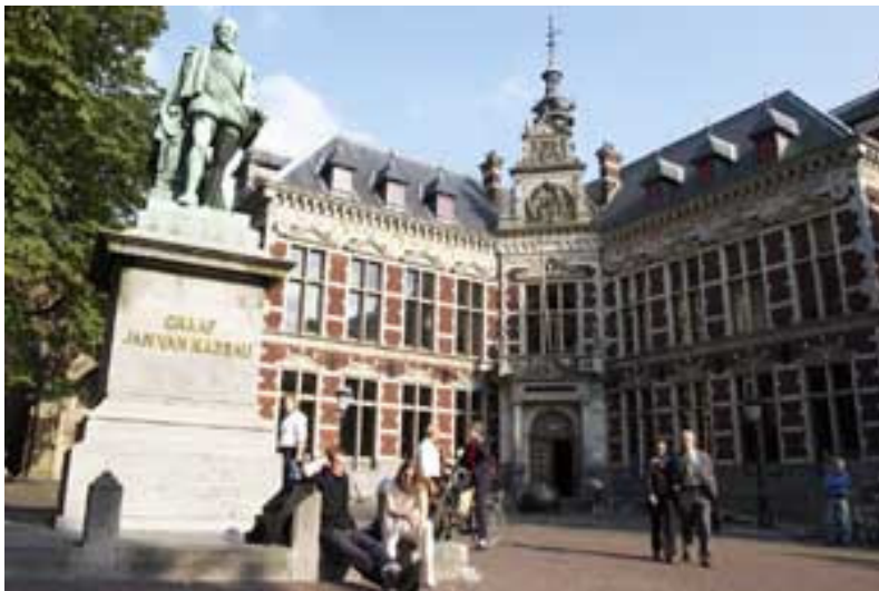
Above: The Academy Building. See ie achterzijde voor plattegrond Centrum & Domplein.

Walking from Utrecht Central Station to the Dom Square will take approximately 15 minutes. Leave the station by entering the Hoog Catharijne shopping mall, head for the 'centrum' exit. After 150m make a left towards the 'Godebaldkwartier' and follow the signs that read 'Trindenborchkantoren'. Once reached, take the escalator down and directly make a left. Cross the Catharijne-overpass and keep walking straight ahead until you reach the 'Mariaplaats'. Make a right, and directly after that, a left. You should now be walking into the 'Zadelstraat', headed straight for the Dom Tower. Walk through the tower's archway to reach the Dom Square. The Academy Building will be on your right.